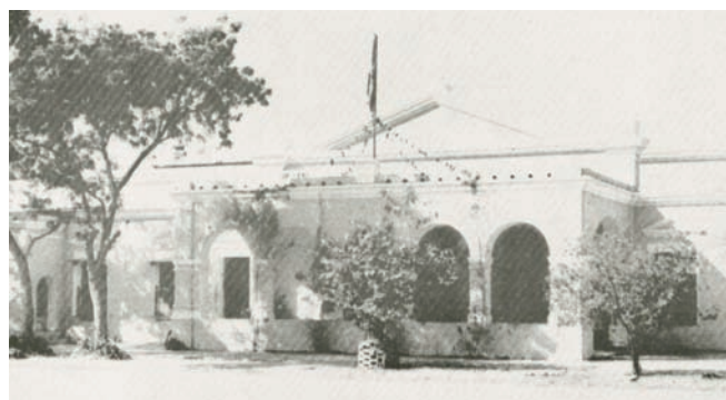
High Court at Agra (BL W3552)

The archives of missionary societies are a great source of information since missionaries were expected to send regular