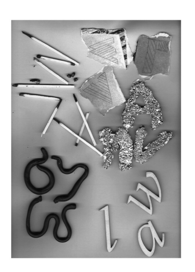
Trial and error