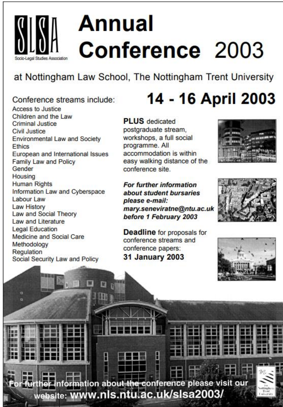
Figure One: Excerpts from SLSA Newsletters in 2003 and 2005, advertising the SLSA conference